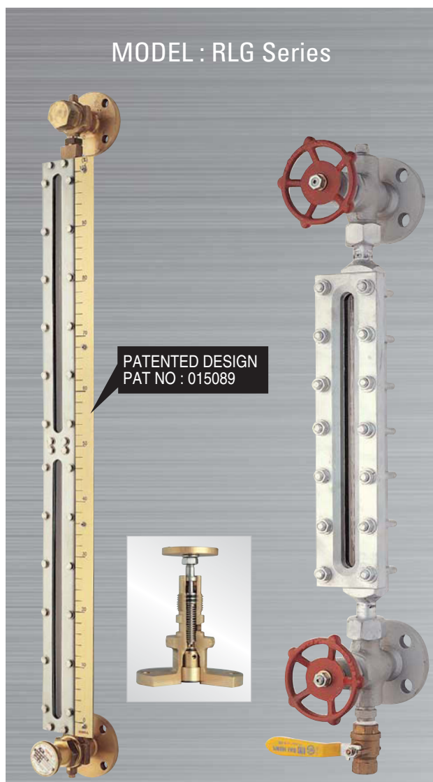
· RLG-LP Series