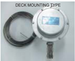
DECK MOUNTING TYPE